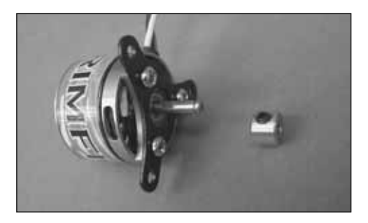
Loosen the set screw in the brass collar and slide it off the back of the motor shaft.

Remove the set screw that locks the motor shaft to the front endbell.