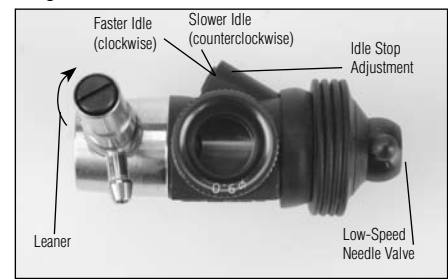
High-Speed Needle: 31/2 turns out (counterclockwise) from closed.

We suggest the following settings for breaking in your engine: